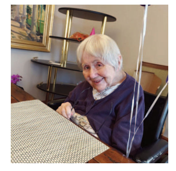
The artist in her later years

Although I did not become an artist myself, she inspired in me a lifelong interest in art. I will always remember standing next to her at the Art Institute of Chicago, carefully analyzing the Impressionist paintings in the museum's permanent collection. My grandmother also influenced my passion for social justice. We used to talk weekly over the phone about politics and various social issues. These discussions would later inspire me to not only pursue an academic career