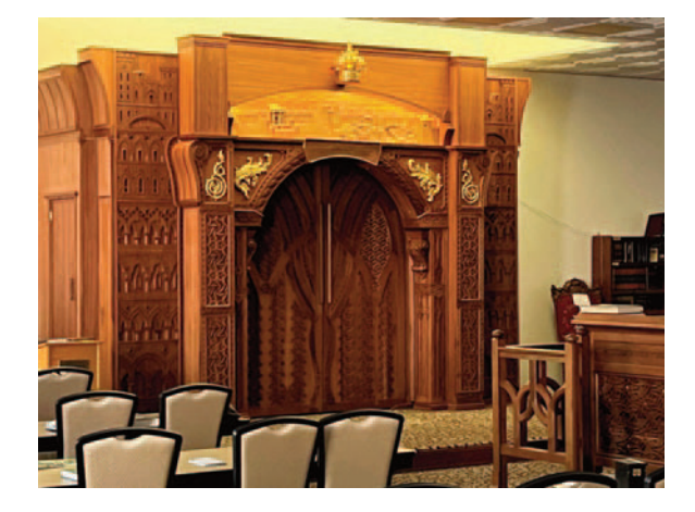
Interior of Chicago's Sephardic Congregation