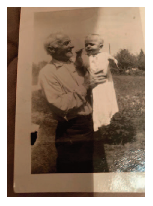
The author and her paternal grandfather

Mom and I moved quite a bit in my first 10 years of life — back to Chicago, then to Florida and Benton Harbor — so that she could remain gainfully employed. By the time I was in fifth grade, we had returned to Sawyer permanently. The middle school I attended was a new building that accommodated students from several communities.