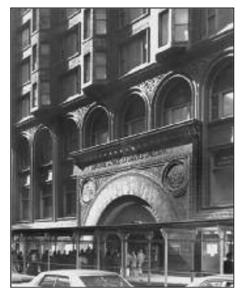
Chicago Stock Exchange. Dankmar Adler & Louis Sullivan, architects. 1894. Demolished 1972.

Photograph by Richard Nickel, who died in an accident while documenting the demolition. Cover illustration: The Complete Architecture of Adler & Sullivan.