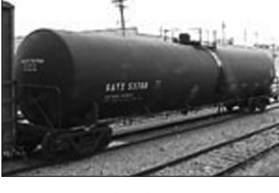
GATX 53760 tank car. Photographed on December 5, 1998 at the Elk Grove Village yard.