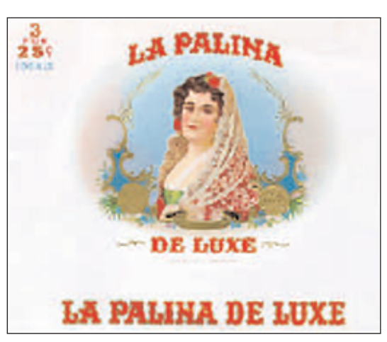
La Palina cigar box art.