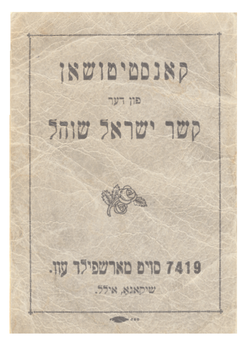
Kesher Israel Constitution, 1930. Cover printed in Yiddish: "constitution fun der kesher yisrael shul. 7419 south marshfield ave., chicago, ill." Two numbers in the address are transposed; it should read "4719." Chicago Jewish Archives, Spertus Institute of Jewish Studies.