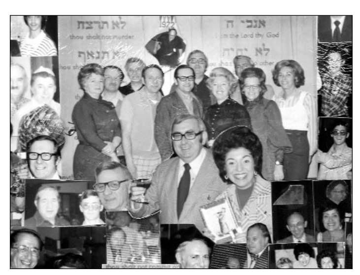
(Left) Bnai Emunah Board, 1962-63; (right) undated photomontage, 1970s.

he history of Jewish Chicago is a story of movement, of demographic change, and shifting populations. Congregation Bnai Emunah was founded during the post-WWII movement out of the city, and benefited from the surging Jewish population in the northern suburbs. A major presence in Skokie for a half-century, it closed this summer, a victim of declining Jewish population in the neighborhood. The archival records of the congregation have been brought to the Chicago Jewish Archives, Spertus Institute of Jewish Studies.