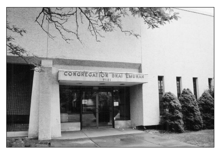
(Left) Bnai Emunah bimah; (right) entrance, 2004.