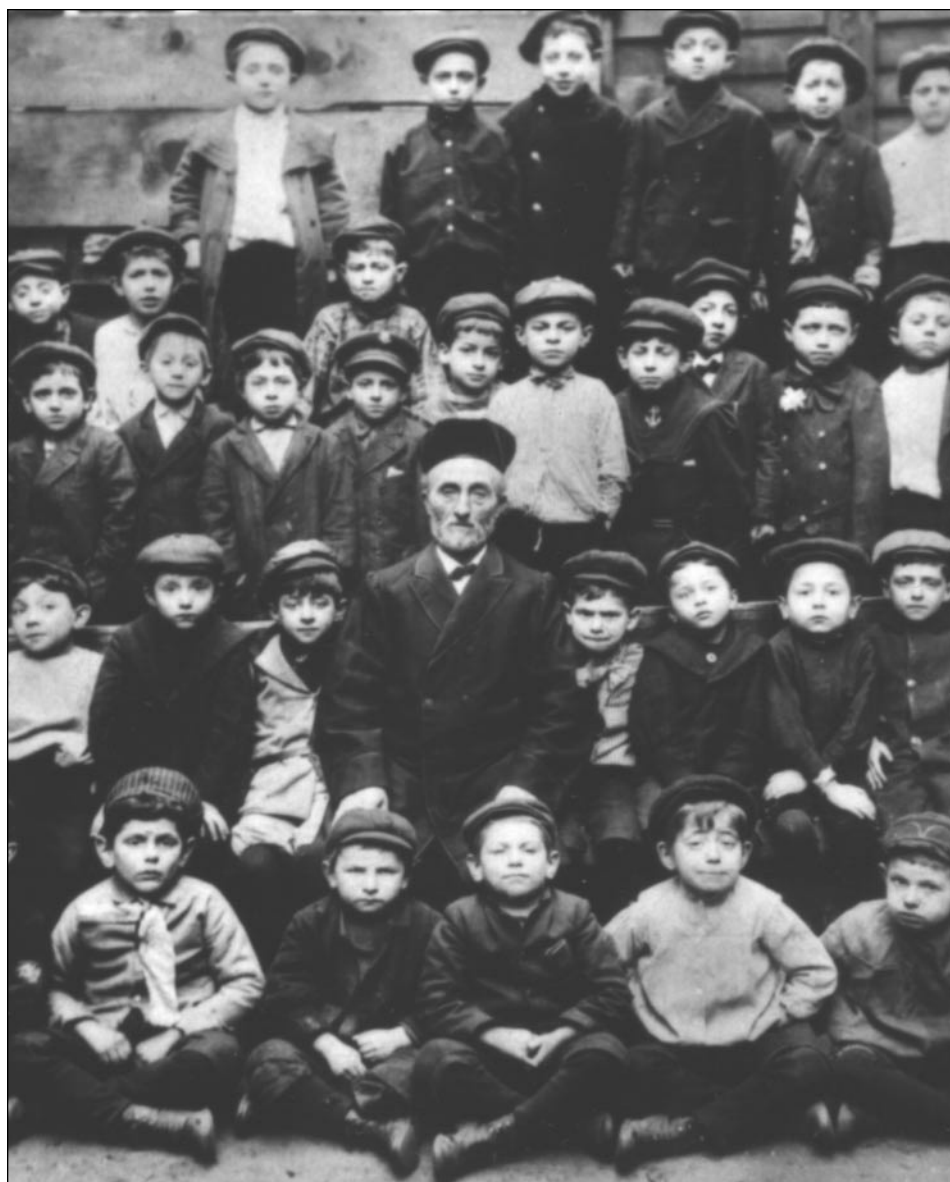
Cheder c. 1906. Located at, or near, DeKoven and Jefferson Streets (site of the start of the Great Chicago Fire of 1871). Detail, cover illustration, Jewish Chicago: A Pictorial History.