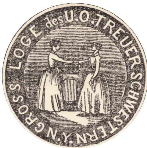
Logo, United Order of True Sisters.

Johanna Lodge played a crucial role in establishing the Bureau of Personal Service, which had originally been founded by the National Council of Jewish Women. The Bureau of Personal Service aided Russian refugees fleeing the pogroms; a workroom and a soup kitchen were established, and women who worked in them were paid in the form of