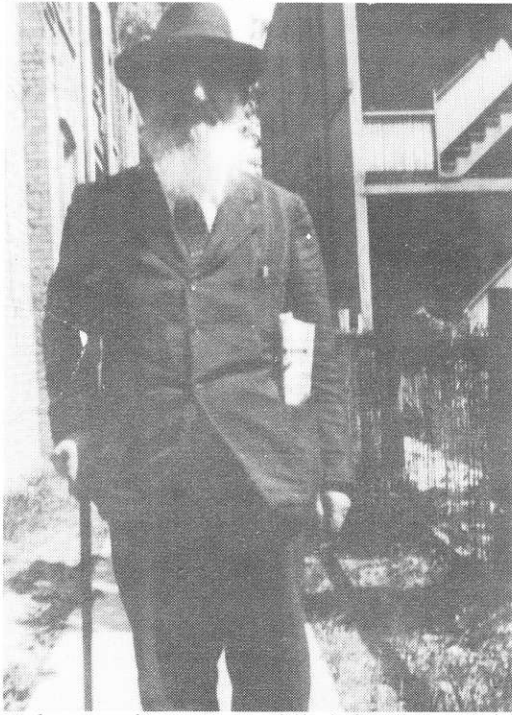
The grandfather and his protege: 1933 Note the Yiddish "Forward" in his pocket at age ninety-three.