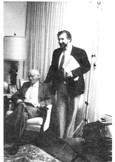
Hillel Center, which is currently open to the public as well as UIC students, is located at 929 South Morgan Street. □