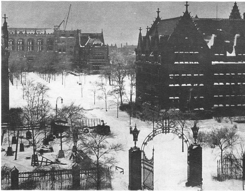
University of Chicago, circa 1908

Hall, despite Julius Rosenwald's reluctance to allow any building to be named for him. The school's medical complex is full of institutions named for Jewish benefactors. There are the Max Epstein Clinic, the Goldblatt Cancer Research Center, the Bernard Mitchell Hospital and the Arthur Rubloff Intensive Care Tower. The medical school itself is named for the Pritzker real estate family. And the Regenstein family, of printing fame, gave the money to establish the world-class library.