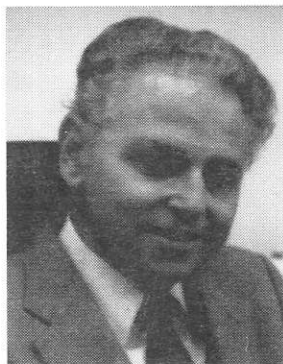
President Walter Roth

As we are on the subject of World Fairs, the Jewish Archives of Spertus Museum has mounted an exhibit on the second floor of the Spertus building containing posters, fliers and other materials pertaining