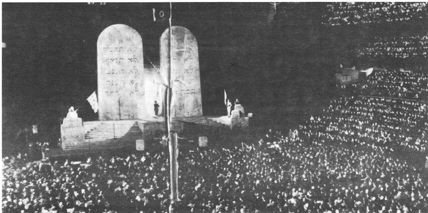
The Stage at Chicago Stadium

who killed 25 Japanese until a sniper's bullet stilled him. The Nazis said "The Jews cannot fight," jeered the narrator, "Wait until Barney Ross gets to Berlin." Ross, the world middleweight boxing champion raised in Chicago's Maxwell Street area, would go on to win a U.S. Congressional Medal of Honor for his war-time contributions.