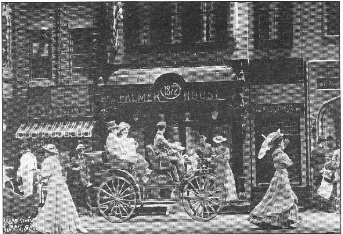
from the 1995 Broadway cast of Show Boat

In 1934, she decided to go on a trip to Egypt and Palestine. She detested Egypt, the Land of the Pharaohs. "I can't account for it," she wrote. "The fields seemed to me to be fertilized with old dried blood of centuries." Palestine was different. She now recalled that the Jews