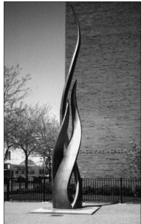
Egon Weiner, Pillar of Fire , 1961. Sculpture in front of the Chicago Fire Academy commemorates the Great Fire of 1871. View is from the corner of De Koven and Jefferson Streets, looking from the south.

CJHS is grateful to the officers, board, and staff of the Selfhelp