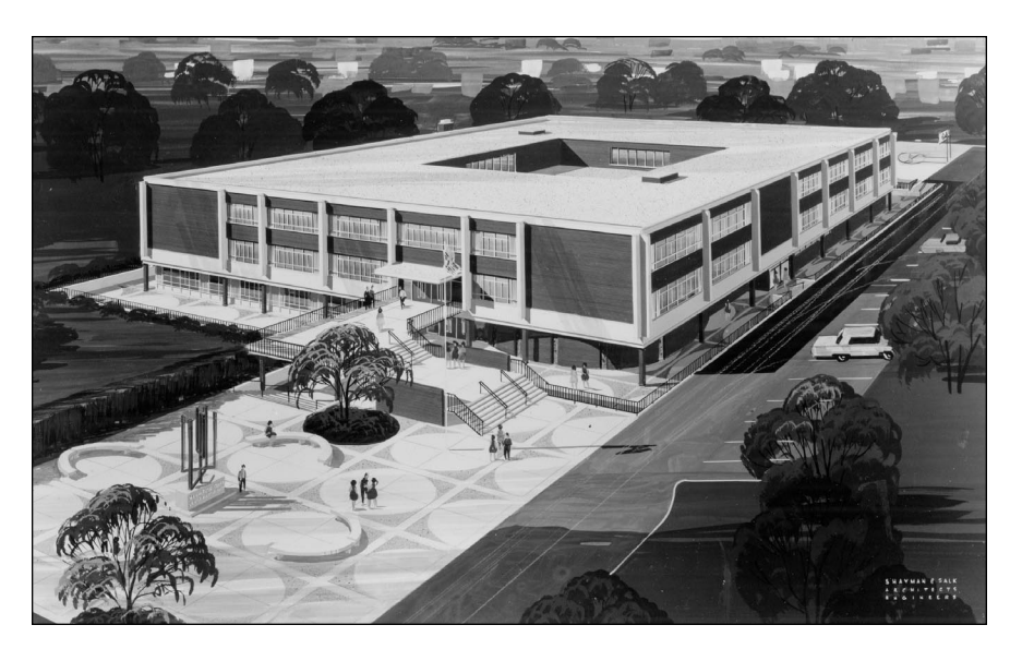
Ida Crown Jewish Academy; Architect's Drawing. Chicago Jewish Archives.

From the northern suburbs, take the #290 PACE bus to Touhy (7200 N) and California and walk 1/2 mile south to Pratt. For schedules, call the RTA Travel Information Center (312) 836-7000.