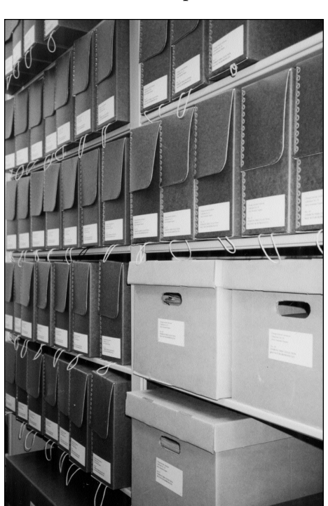
At the archives, collections are kept in acid-free storage containers and under strict temperature and humidity controls.

Archivists are accustomed to watching eyes glaze over whenever they use the word "cataloging." But the truth is that without accurate records of what collections we have and what they contain, researchers would have a difficult time using them. For many years there was no