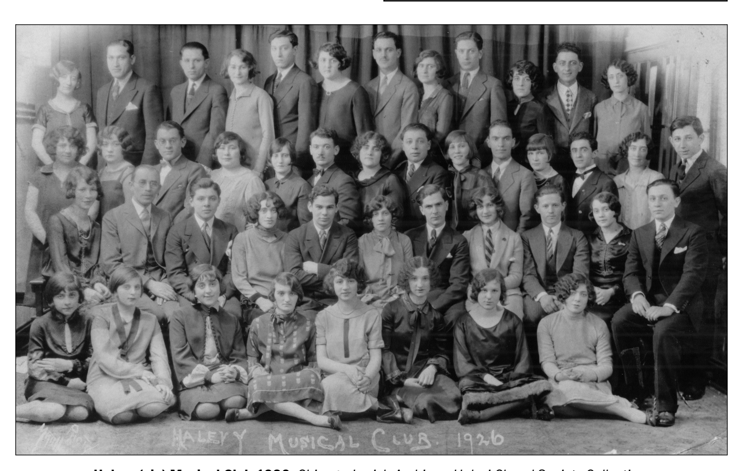
Halevy (sic) Musical Club 1926. Chicago Jewish Archives; Halevi Choral Society Collection.

MONDAY, APRIL 15 via ALL cable services CHICAGO ONLY 25 3:00 p.m.