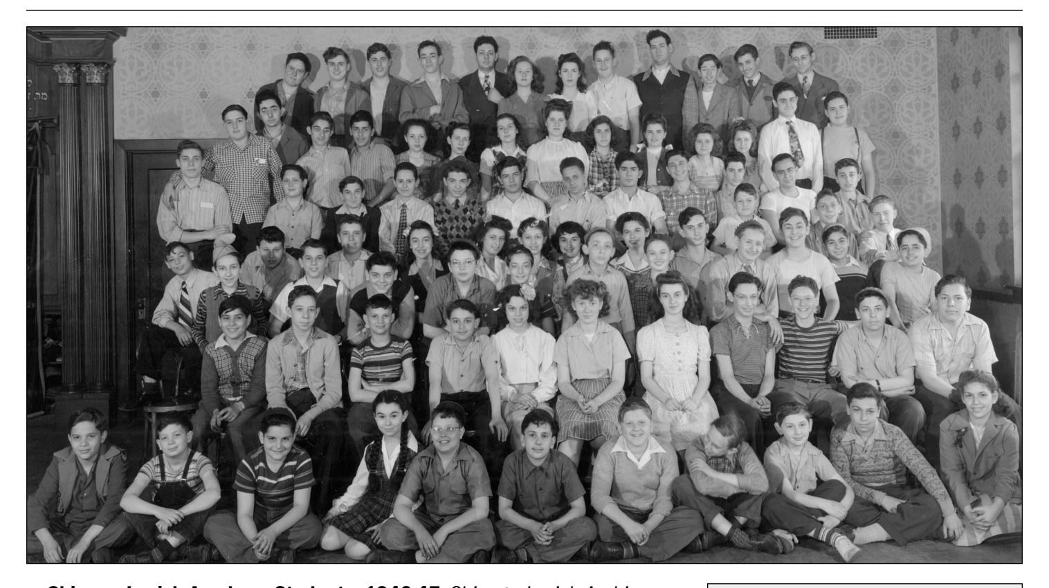
Chicago Jewish Academy Students, 1946-47.