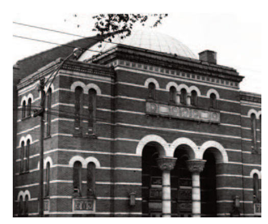
The now-defunct Congregation Shaare Zedek, which graced the Logan Square neighborhood

Yet rather than striking a lugubrious tone, Packer offered a more nuanced, and somewhat hopeful, message, arguing that many of the ornate, intricately designed buildings that had once served as synagogues in the late 19th and earlier part of the 20th centuries remain intact—as churches. A case in point, he said, was the Cross & Crown Community Church, at 3707 West Ainslie Street, which had once housed Kehilath Jeshurun Synagogue.