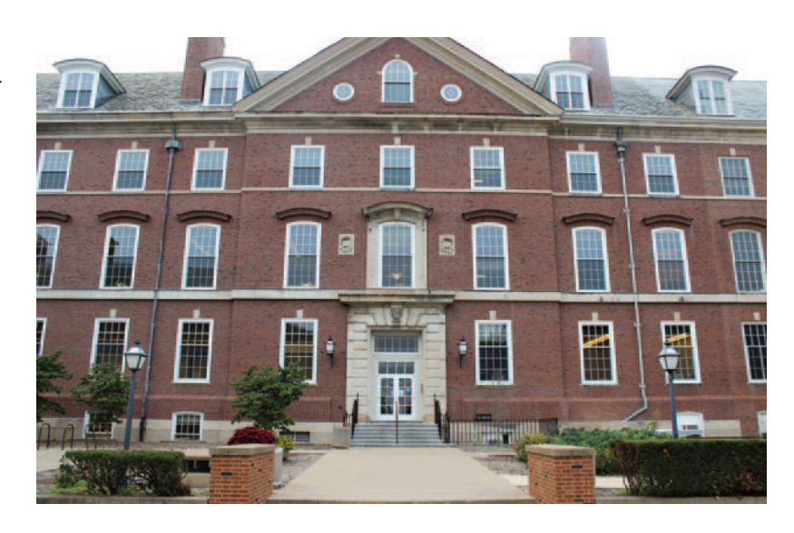
The facade of the main library at the University of Illinois Urbana-Champaign, which houses the newly established Central Illinois Jewish Communities Archives/Mervis Archives

But what of Jews from other parts of the state—from, say, Bloomington/Normal, Decatur, Moline, Rock Island, Springfield, Urbana/ Champaign, Danville, Peoria, Quincy, Ottawa, Mattoon, or Granite City? Though paling in number to their Chicago-area landsmen—perhaps making up less than 10 percent of Illinois's Jewish population of approximately 300,000—they, too, have led lives of meaning and interest.