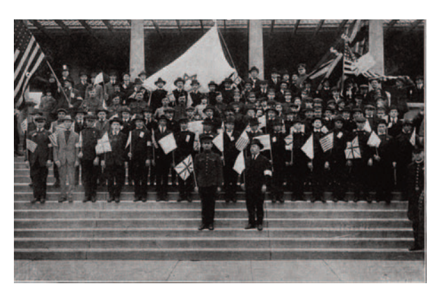
The members of the Jewish Legion on the steps of the Douglas Park Refectory, April 1918.

had been in preparation and was issued on November 2, a few days after the Battalion was convened.) This was a fighting force, to operate in Palestine. The initial enlistees (most of the 38th) were from Britain, many of Russian birth. Later groups of volunteers came from the United States, Canada, Russia, and other countries. The 39th consisted mostly of Americans and Canadians; and a 40th, of lews in Palestine. Both