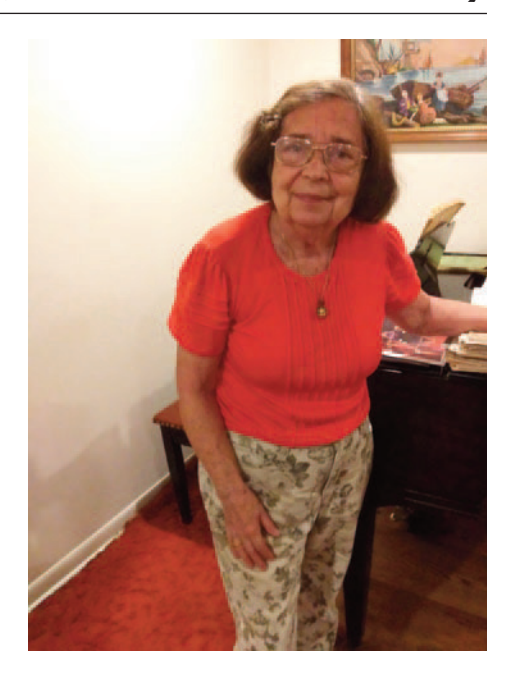
The author, in a recent photo