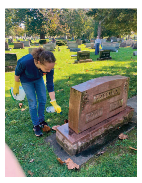
Students from the University of Illinois Urbana-Champaign's Hillel recently took part in a cleanup of Danville's Jewish Cemetery, which dates back to the 1870s.

The answer, she suggested, is found in the Central Illinois Jewish Communities Archives/Mervis Archives.