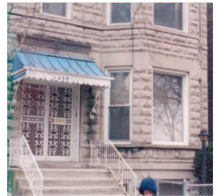
The author's childhood home at 1539 South Spaulding Avenue

In 1926, three years after my birth in Maxwell Street, my family left the area and purchased a two-story home with a big mortgage at 1539 South Spaulding Avenue. At that age, I spoke mainly Yiddish. I was taught Yiddish songs by my four older sisters, the youngest of whom was 13 years my senior. In a sense, I was raised by five dotting mamas who themselves were raised in Eastern Europe. As for the songs, my Jewish neighbors sitting on their front porches in the summer would call me over to sing for them.