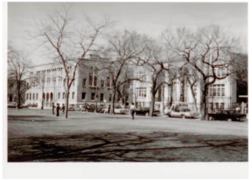
The Hebrew Theological College (right) and the Jewish People's Institute were located opposite each other on the corner of Douglas Boulevard and South Saint Louis Avenue.