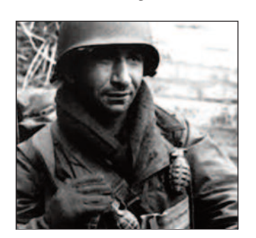
WWII American GI wearing a wool knit muffler.

When the war began in December 1941, Vienna Art Knitting Mill was securely established producing sweaters for a wide array of Chicago retailers. Its quota of wool, now in short supply and rationed by the government, enabled the enterprise to grow. I was now 12 years old and began to work in the firm on Saturdays. A contract to knit mufflers for our soldiers helped to assure wool supplies and the firm's growth. I fondly remember brushing those mufflers as they came off the knitting machine, to give them extra warmth.