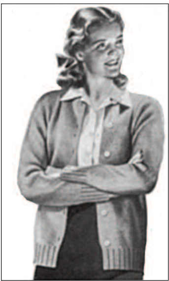
1940's Sloppy Joe sweater.

popular sweater called the Sloppy Joe. Teenage girls and their mothers wanted to wear them. The firm prospered as a major Chicago supplier of this popular sweater. When the war ended Vienna Art invested heavily in automatic knitting machines to produce Sloppy Joe cardigans. But almost overnight,