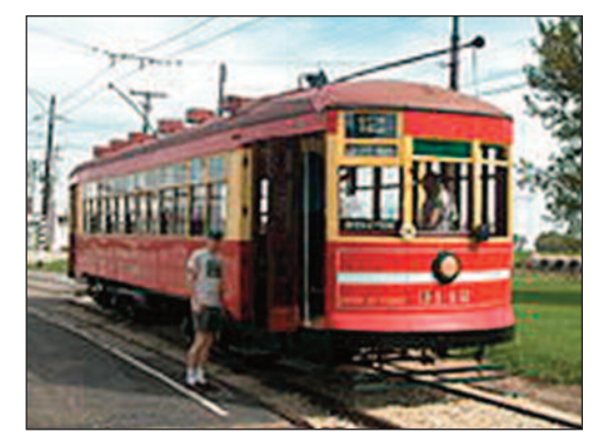
Chicago Surface Lines Car 3142 at the Illinois Railroad Museum.

"the boys," we always got on and off at Kildare. But it was no fun simply getting on the stopped streetcar. We preferred to let it start to go, run after it, and then leap onto the single descending step as we grabbed one of three vertical poles and hoisted ourselves onto the platform where the uniformed conductor, usually redfaced and sometimes reeking of distilled spirits, stood in his worn and shiny navy blue uniform and cap taking fares, dispensing coins from the silver changer at his waist, and issuing transfers. Often he wore a rubber thumb. We seldom sat in the wicker seats unless we were with our parents and grandparents. We preferred the open area at the back, the choice front window adjacent to the motorman, or the rear step where you remained all the way home, freezing in winter or enjoying the summer breeze, squeezed in among the packed crowd during rush hour.