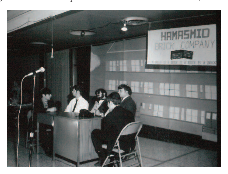
HTC "Hamasmid Brick Company" Purim shpiel, 1971.