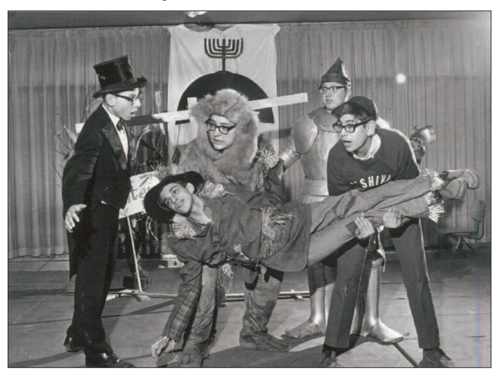
HTC "Wizard of Odd" Purim shpiel, 1966.

Then, as always, Purim ended and matters returned to normal. The administration and faculty resumed their prominent places within and without the institution while the students reclaimed their seats as well as their senses. Just as in Europe, the Purim shpiel phenomenon suited yeshivot in Chicago and elsewhere in the United States. It served as a healthy dose of subversive wit and cautious criticism. Most important, its effectiveness was a credit to the students' pledge to halt the humor after Purim and the school's promise to schedule another shpiel for the following year. �