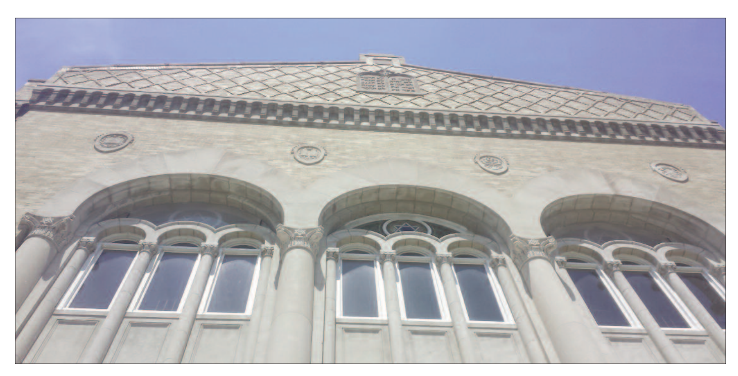
Stone Temple Missionary Baptist Church, 3622 West Douglas Blvd, corner of Millard, the former First Romanian Congregation Shaarei Shomayim.