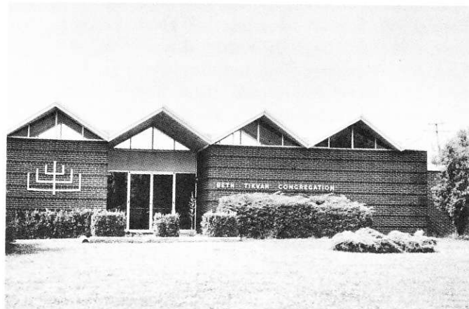
The current home of Congregation Beth Tikvah in Hoffman Estates.

When the Conservative movement was not interested in helping the congrega-