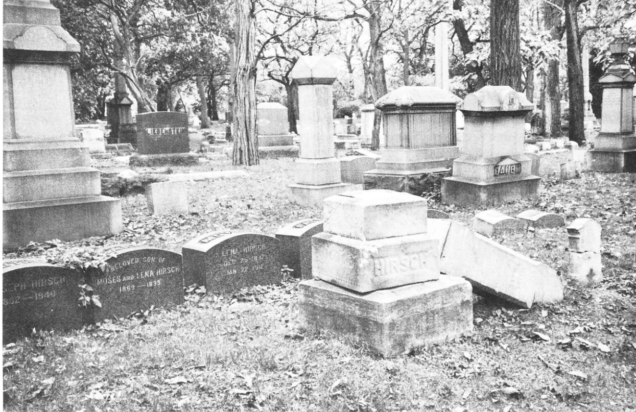
Graves at Jewish Graceland, the area's oldest Jewish cemetery. All the graves are victims of time; some are victims of vandalism.